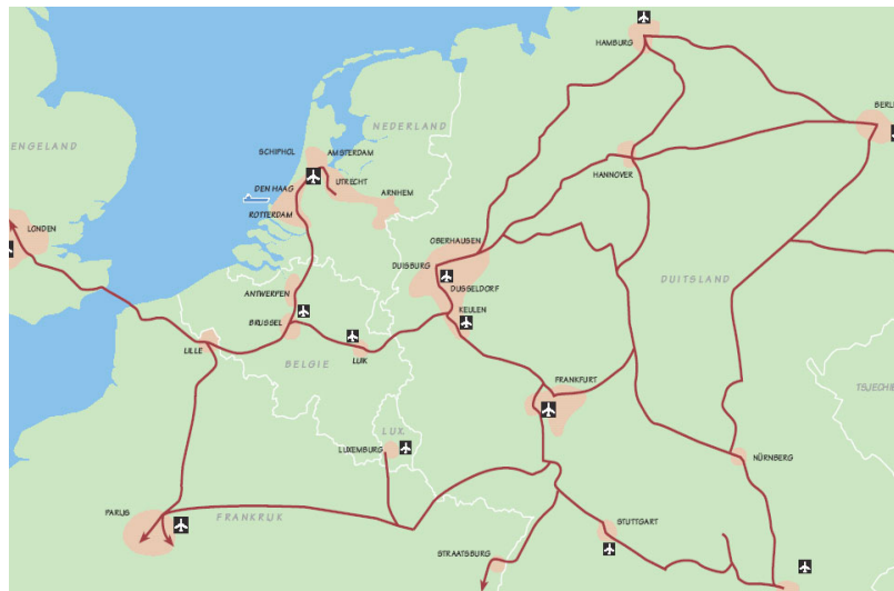
Figure 4 High–speed connections in Northwest Europe (>200 km/h)

The following example illustrates the importance of properly coordinated promotion efforts. International companies visiting the EU in Brussels to talk about a suitable place of business in the Eurodelta area as the “Western Gateway to Europe” are given a documentation folder including the following map.