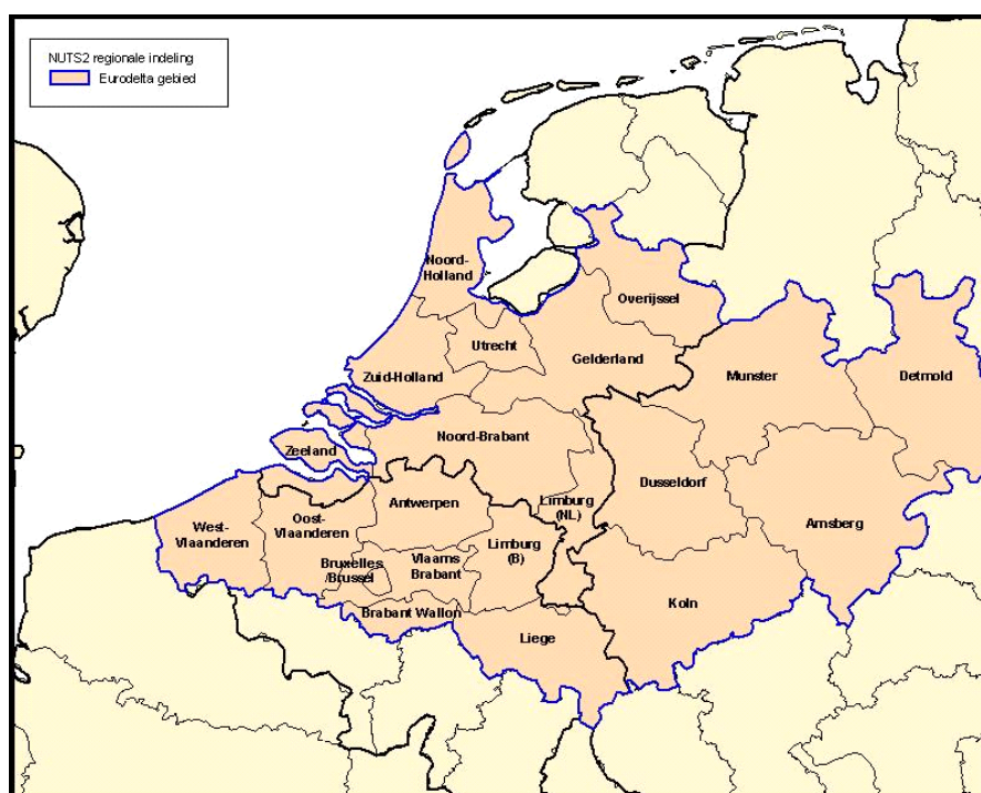
Figure 1 NUTS-2 regions included in the Council's hypothetical research area

Just to be perfectly clear: the area defined is a preliminary research area . The Council does not recommend marking the area in an administrative sense.